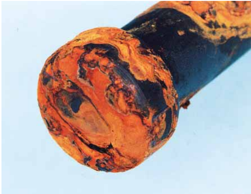
Corroded end tube and tip on competitive sample after 27-hour salt fog exposure.