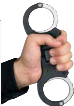
The palm swell on Rigid Handcuffs provides a comfortable, hand filling grip.